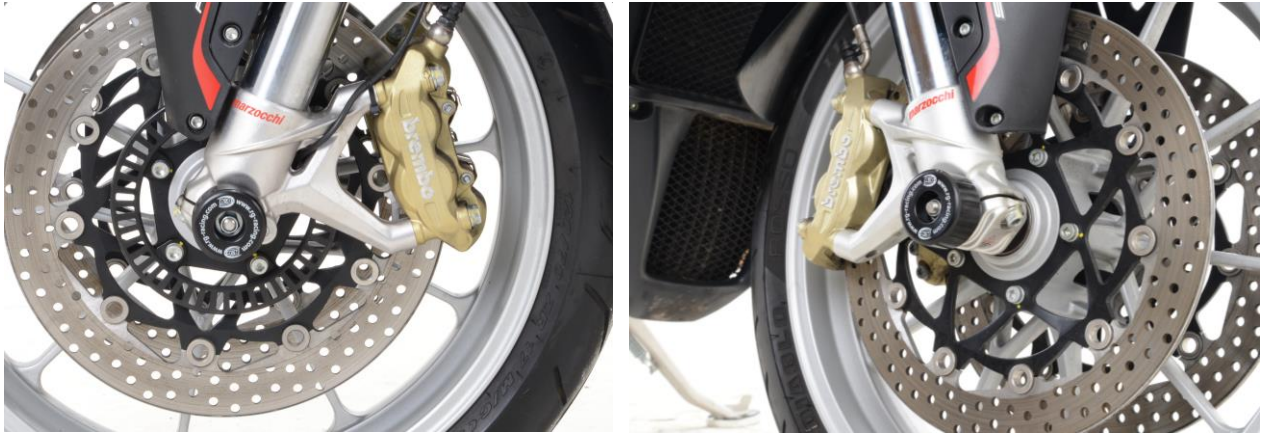
THE ABOVE PICTURES ARE REPRESENTATIVE ONLY

THIS KIT CONTAINS THE ITEMS PICTURED AND LABELLED BELOW. DO NOT PROCEED UNTIL YOU ARE SURE ALL PARTS ARE PRESENT.